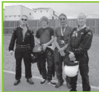
Friends and family at Racing for Research

Great Father's Day or Graduation Gift Idea!