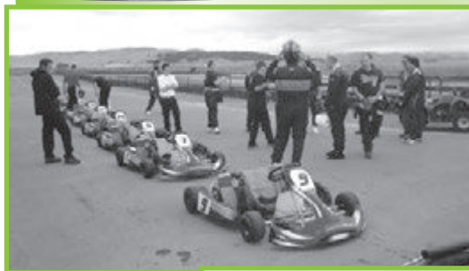
Getting ready to drive