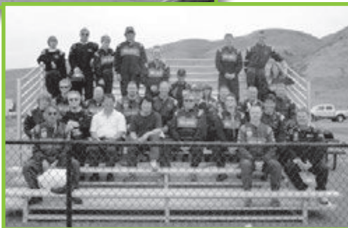
Participants at the 2010 Racing for Research day

Great Father's Day or Graduation Gift Idea!