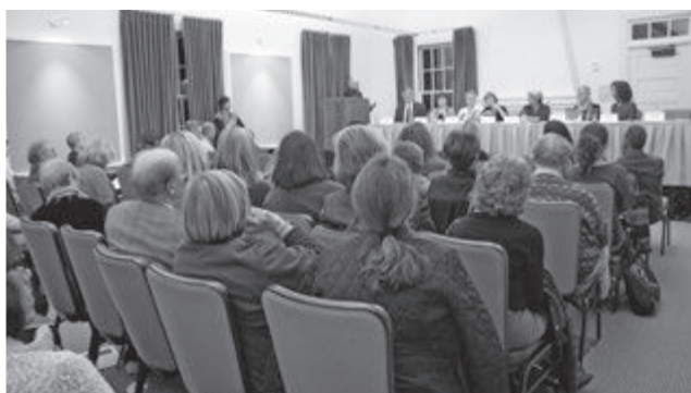
Attendees at the November 2009 Community Forum

*See the link at the end of this article to view the extended Q&A session summary.