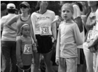
The Dipsea Hike/Run Lite is a family-oriented event