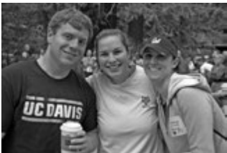
Dipsea Hike/Run Lite 2009 Hikers

The 7th annual Dipsea Hike/Run Lite was held on September 29. Everything was perfect – a beautiful and sunny day on Mt. Tamalpais, great food and entertainment, a record number of participants and many generous sponsors. Almost 400 runners and hikers put into practice Zero Breast Cancer’s message about breast cancer risk reduction and the positive benefits of physical activity.