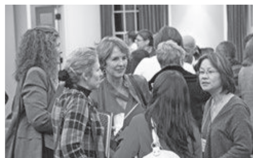
Community members converse following the Forum

In addition, she said, the adolescent risk factor study her organization spearheaded found that women who developed breast cancer were more likely to have one or two glasses of alcohol per day and to have had a high SES as an adolescent. “That fits with what we at the BABCERC are looking at, with risk over the lifetime,” she said. “There may be certain stages where girls or women are more vulnerable to exposures, and one may be adolescence.”