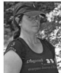
The Young Survivor Coalition Northern California Team hiked the Dipsea Hike/Run Lite