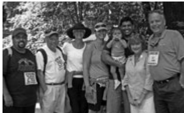
< Mechanics Bank Team at the Dipsea Hike/Run Lite