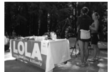
Living Our Lives Actively (LOLA) brought a team to the Dipsea Hike/Run Lite

Mark your calendars for the 2010 Dipsea Hike/Run on Saturday, October 2.