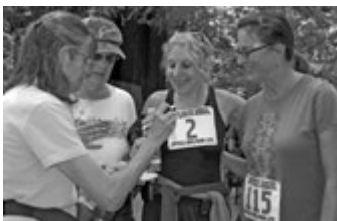
Participants fill out badges to hike in honor of loved ones