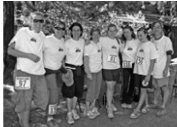
< Kaiser Permanente Division of Research Team at the Dipsea Hike/Run Lite