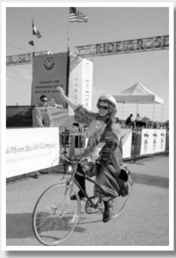
CAN-Do at the Lance Armstrong Foundation Ride for the Roses

CAN-Do also became my courage to face the people that I was afraid of in the medical setting who would tell me what I would endure or confront next. And in the infusion waiting room, which was always full, the sorrow and anxiety was utterly palpable. When I appeared in the crazy clown suit and big red shoes, it became mostly twinkles and smiles with just a few head-down-don't-look reactions. I wouldn't say the experience became fun, but it did change for me and it's been enlightening. I can't imagine having handled it without CAN-Do.