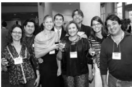
Staff and guests of Honor Thy Healer sponsor Autodesk