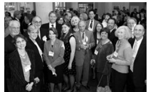
Kaiser Permanente team