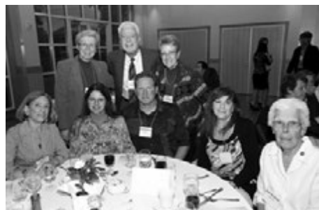
Sponsor Jackson's Hardware and ZBC supporters