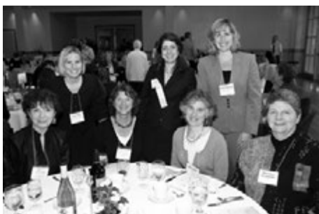
Safeway Foundation members and guests