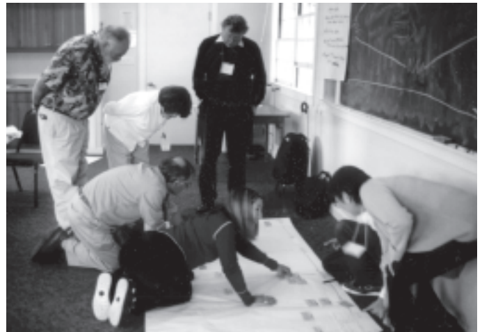
MBCW Board members join with other county and health experts to collaborate at a retreat held in the Marin Headlands.