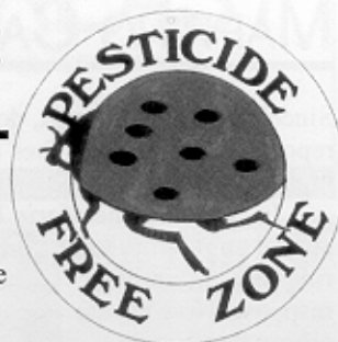
Ladybugs are alighting all over the East Coast

For more information, call (415) 459-1391.