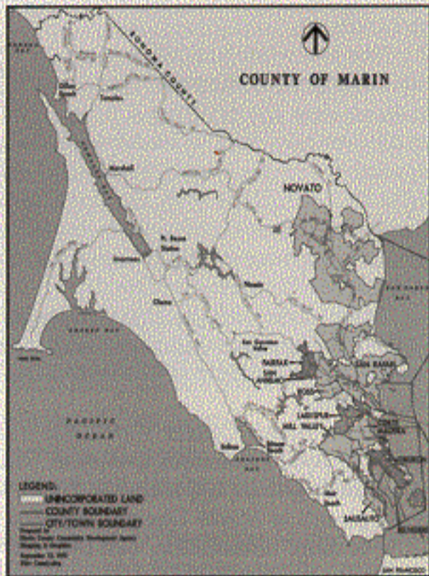
Marin Breast Cancer Watch will pinpoint cancer and pollutants on this map